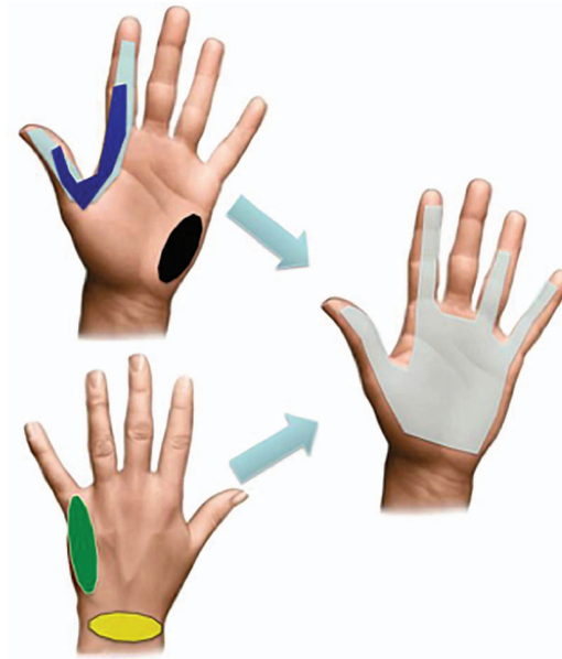
Figure 9.1 Schematic representation of the areas of the patient’s phantom hand involved by the sensation during intraneural stimulation. On the left side of the picture, the areas of the phantom hand where the patient felt the sensation stimulating with five channels individually can be seen. On the right side of the picture, the area of phantom hand where the patient felt the sensation by stimulating simultaneously with the same five channels can be seen.

During the 10 days of treatment, the patient described a significant and progressive decrease of his phantom limb pain (Figure 9.2) that was referred as less “stabbing”, “sickening”, “sharp”, “fearful”, “gnawing”, “cramping”, “hot”, “aching” and “heavy”. The patient experienced a maximum decrease of pain intensity from 9 to 4/5 according to the VAS. A sensation of partial opening of the phantom “clenched fist” was also referred by the patient together with the pain decrease. However, the effect of treatment was of short duration lasting only some hours after therapy; during the first three days of therapy (lowest VAS score between 6 and 7, PPI score 4 and McGill score between 12 and 20), the pain came back to normal before the patient went to sleep, whereas during the last days of therapy, the relief from pain lasted until the patient went to sleep and pain came back to normal when the patient woke up (lowest VAS score between 4 and 5, PPI score 3 and McGill scores between 6 and 9).