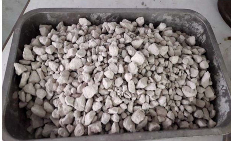
Figure 1 CLC fragment recycled remain on the sieve.

3 Producing CLC foam from foaming agent with foam generator machine and air pump. Immediately leaving the generator, the smooth foam must be used rapidly since deterioration after mixed exposure to the environment.