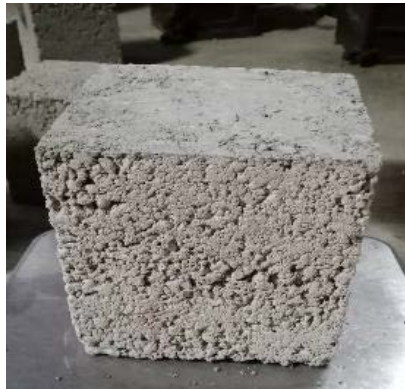
Figure 2 General concrete block specimen.