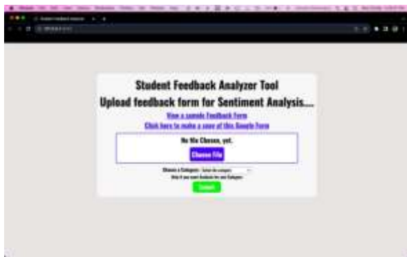
Fig. 3. Landing Page