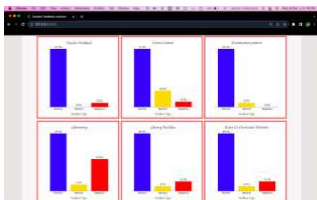
Fig.5.Graphs showing impact