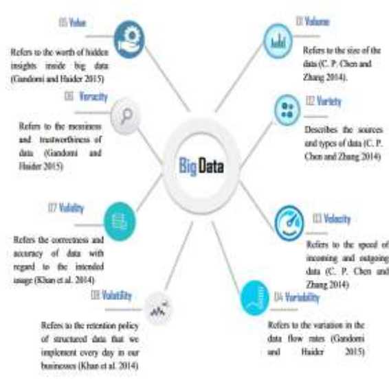
Fig. 2: Big Data dimensions

Yaqoob and colleagues (2016) argue that the proliferation of internet-connected mobile devices and sensor-equipped devices has a significant impact on data velocity. Fan and Bifet (2013) suggest that delivering timely responses and updates is critical for evaluating an application's effectiveness. In addition, interpreting and organizing streaming data is a challenge that requires relevant technologies and techniques (Orgaz et al., 2016). Big Data is characterized by additional features, such as veracity, which refers to the reliability and messiness of data, according to IBM and Microsoft (Gandomi and Haider, 2015). Storey and Song (2017) maintain that veracity poses problems with data quality, such as accuracy, completeness, timeliness, consistency, and accessibility. Value, the fourth V of Big Data, was introduced by McKinsey and Oracle to highlight the value of hidden insights in Big Data (Chen and Zhang, 2014). Wang et al. (2017) expand on this concept by proposing five V dimensions for Big Data that consider both value and veracity. Uddin et al. (2014), on the other hand, identify seven Vs of Big Data, taking into account both the validity and volatility dimensions. They define volatility as the retention policy for structured data typically used in organizations, while validity refers to data accuracy and correctness regarding its intended purpose. The many Big Data dimensions and their associated names are shown in Figure 1.