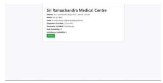
Fig. 4 User's Page

In the admin page the current details of the hospital will be available along with the option to update the details of the hospital such as treatments provided, diagnostics provided, availability of ambulances and beds, details of the doctors working in that hospital and the location of the hospital.