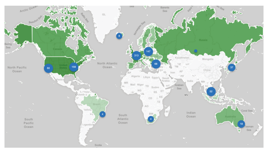
Figure 6.1 Map of deployed SISSDEN sensors.

Intelligence data for timely threat detection and prevention will be provided by a new start-up company called SISSDEN BV (https://sissden.com), launched by three SME partners (CyberDefcon, UK/The Netherlands, Montimage, France, and Eclexys, Switzerland).