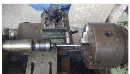
Figure 3. Burnishing tool attached to lathe tool post.

The burnishing tool used during study features a 10 mm diameter tungsten carbide ball that is supported by a ball bearing that is attached to the fork arm. Using a spring-loaded subassembly, the required burnishing force may be applied to the workpiece. Fig. 3 shows how the burning tool shank fits on the tool holder of a lathe with ease.