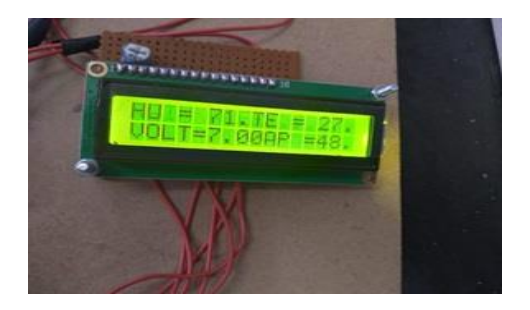
Figure 3. Display of output in LCD