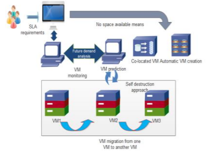
Fig 2: Proposed framework