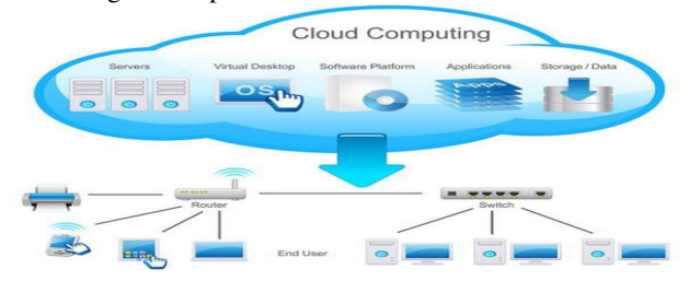
Fig 1: Cloud Deployment Model