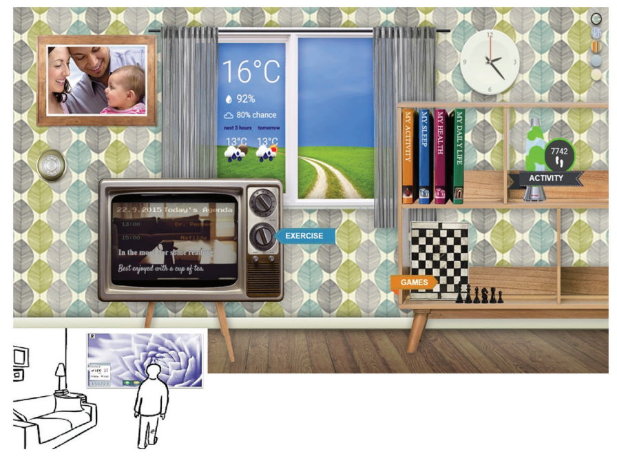
Figure 13.6 Example of an integrated caring home environment, offering health, wellness and safety services to people with chronic conditions (http://ewallproject.eu/).