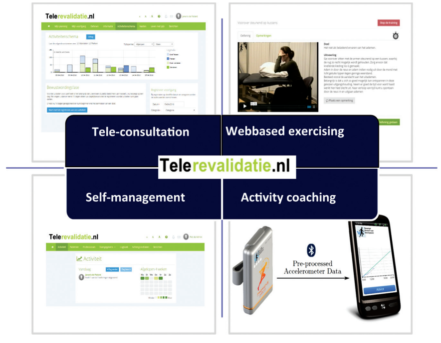
Figure 13.1 Example of a patient platform, supporting web based exercising, video teleconsultation, self management and activity coaching (continuous care and coaching platform, RRD).

A next step in the training at home involves much more complex systems involving games to make the exercises more enjoyable and persuasive, combined with passive or active robotic support systems to correct the movement and/or support the patients in carrying out the desired movement when muscle force is still not sufficient. An example of such a combined system is the Script system, developed in the European Script project; targeting upper extremity training for stroke patients is shown in Figure 13.2. It involves an arm/hand support system that allows personal adjustment of the amount of support, sensors to control the game and a number of games that vary in difficulty and a decision support system that recommends individual game setting and a choice of the games.