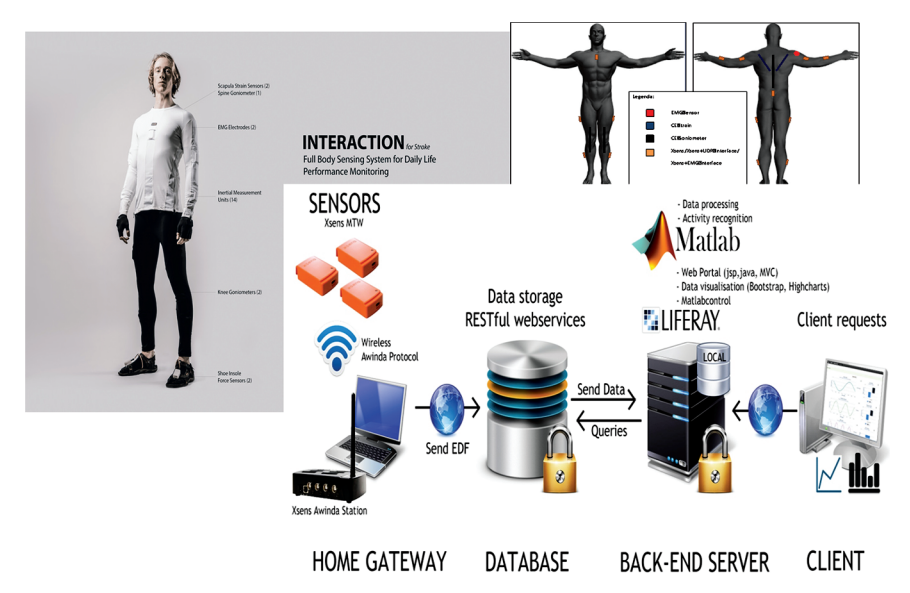
Figure 13.3 The different components of the Interaction monitoring system (https://www. xsens.com/news/interaction-project/).

Here a complete movement analysis system has been developed with motion sensors embedded in smart textiles, able to monitor the activities of a person in his own environment. It involves different modalities of sensing like inertial sensors to detect posture and movements, surface EMG sensors to measure muscle activation patterns and 3D force measurement under the foot. The system is presently being applied in stroke patients to monitor how they use their movement capacities in daily life, after a period of rehabilitation. The responses from the clinical users are in general very positive, underlining that these kind of unobtrusive monitoring systems have great promise for future integrated care.