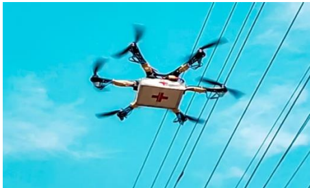
Figure 3 : Experimental medical drone