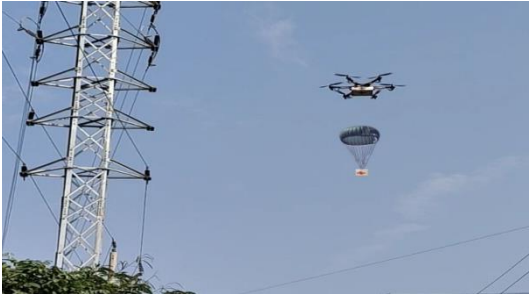
Figure 4 : Experimental medical drone delivering medicines using parachute

Figures 3 and 4 above depict our designed work; figure 3 depicts a medical drone, and figure 4 depicts a drone delivering medicine via parachute.