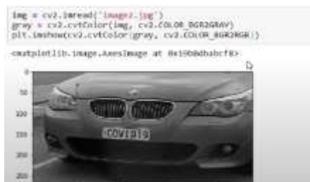
Figure 3.1. Output after using Gray scale on original image

To read in our image and perform some Gray scaling, we have used the open cv imread function shown in Figure 3.1.