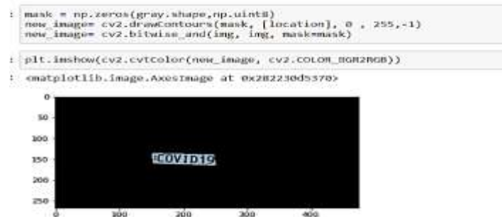
Figure 3.3. Output After Masking the original image

The next thing that we're going to do is apply a contour search, we've accurately detected where our number plate is located. The next step is to just isolate this numberplate portion because doing so will make it much simpler to feed the data to easy OCR as shown in Figure 3.3. The next thing that we're going. To achieve so, we first started by identifying every single portion of our image that isn't black.