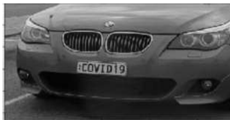
Figure 2.1. A car picture with Number plate which we are going to detect below.

The automatic number plate identification system has numerous difficulties. To improve the input image and make it more suited for the following processing processes, this step is crucial. Pre-processing starts with applying a minimal filter to the image to improve the dark values by expanding their region as shown in Figure 2.1.