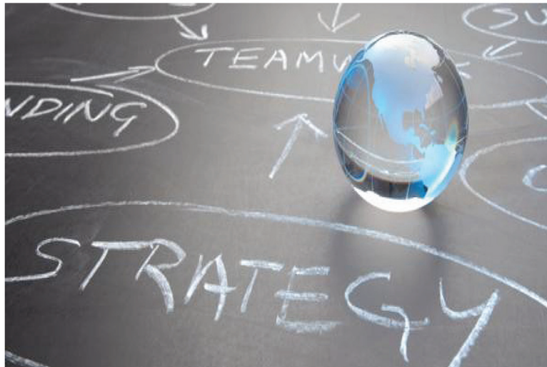
Figure 2.3 IoT industry's fragmentation [10].

iii) the validation of the related business models to guarantee the sustainability of the approach beyond the project.