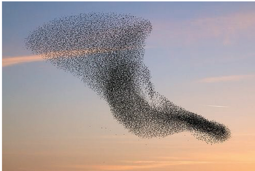
Figure 2.2 Self-organising systems [9].

Whereas it might very be tempting to apply observations from natural and biological ecosystems onto human social and economic systems, several factors indicate that a one to one translation is not directly possible – humans through their brain evolution have a different understanding of existence that other species in natural systems whose primary objective is survival.